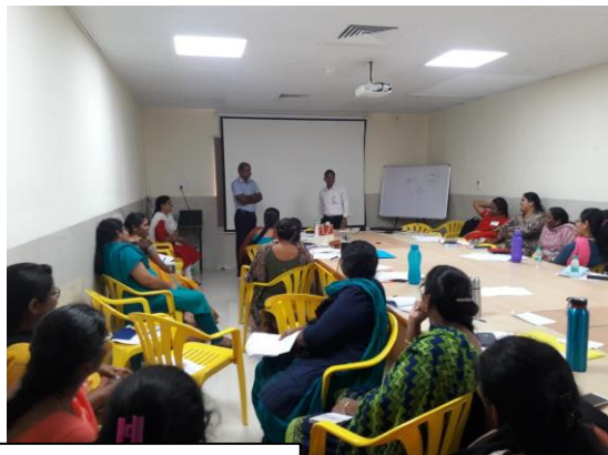
Faculty development Programs